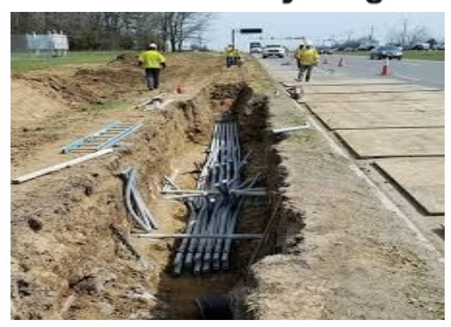
For More Information Contact: Call811.com

WCCA AS A MEMBER ORGANIZATION OFFERS SCHOLARSHIPS IN CONSTRUCTION MANAGEMENT CMU AND WCCC